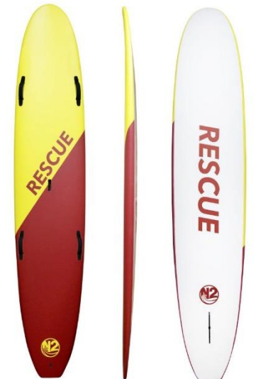
Lifeguard rescue board with side handles, foam topper, bottom skeg. FIGURE CW.5.1