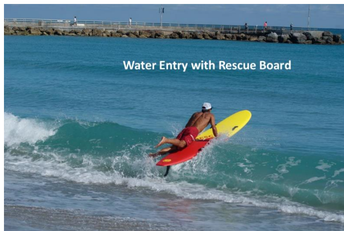
Lifeguard makes a water entry on the rescue board to begin his approach to a possible in-water victim. FIGURE CW.5.2